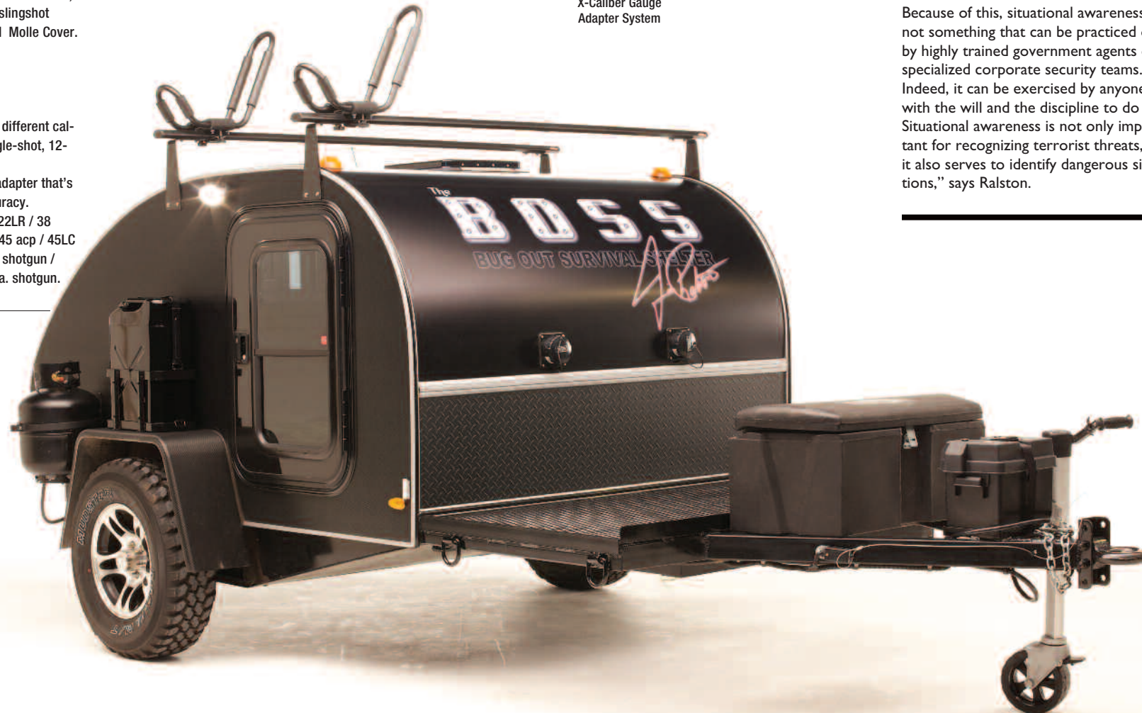
The BOSS: Bug-Out Survival Shelter