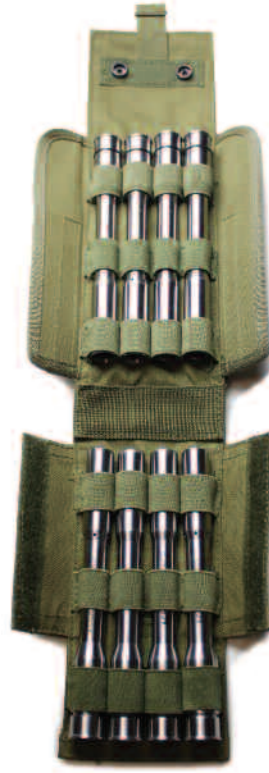
X-Caliber Gauge Adapter System