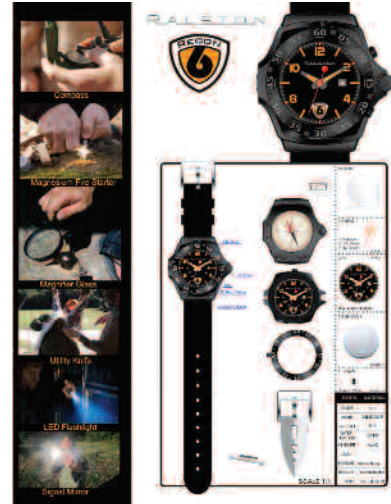
Recon 6 Survival Watch

RALSTON RECON: Gear Up and Rokon have come together to produce a Tim Ralston signature series Trail Breaker called the Ralston Recon, specifically geared for the survival-minded set. Features include dual-wheel drive, 15-inch ground clearance, lightweight tractor-type tires and new, patented Auto-Grab Front Suspension. You can mount pumps, generators, sidecars, gun boots and 50 other accessories to turn the Trail-Breaker into a plow horse or mountain goat. And they even float by virtue of hollow aluminum drum wheels. Drum-like in that you can store up to 2.5 gallons of fuel or water in each wheel. Narrow enough to fit down a row crop or tight tree stands. Tough enough to climb over rocks, fallen trees or other obstacles. Operates for up to nine hours on one fill-up of the almost three-gallon tank and runs on a classic workhorse four-stroke Kohler engine.