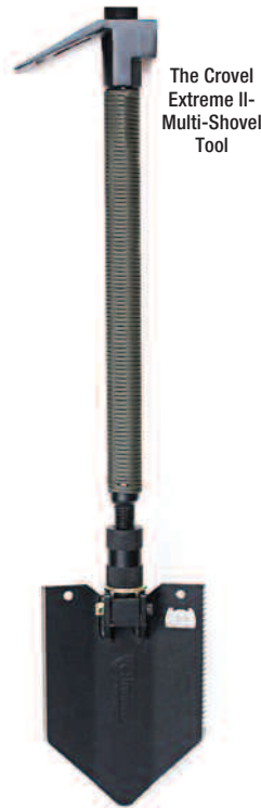
The Crovel Extreme II-Multi-Shovel Tool